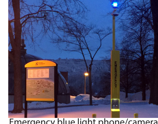
Emergency blue light phone/camera

Michigan Tech IT collaborated with Facilities, the Department of Public Safety and Police Services, and the Title IX office to install five highly visible blue light emergency phones on campus. The project, funded by a grant from the State of Michigan, was to increase the safety of our campus. Each emergency phone has a button that directly dials to campus security and is equipped with four cameras for surveillance.