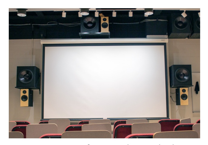
Rozsa 120 main front speakers and subs

Media Technology Services (MTS) provides the University with a wide range of technology support and updates. Several room upgrades have taken place during the Summer and Fall of 2019.