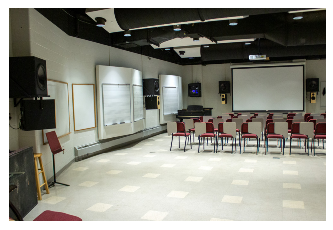
Rozsa 120 7.1 surround sound system