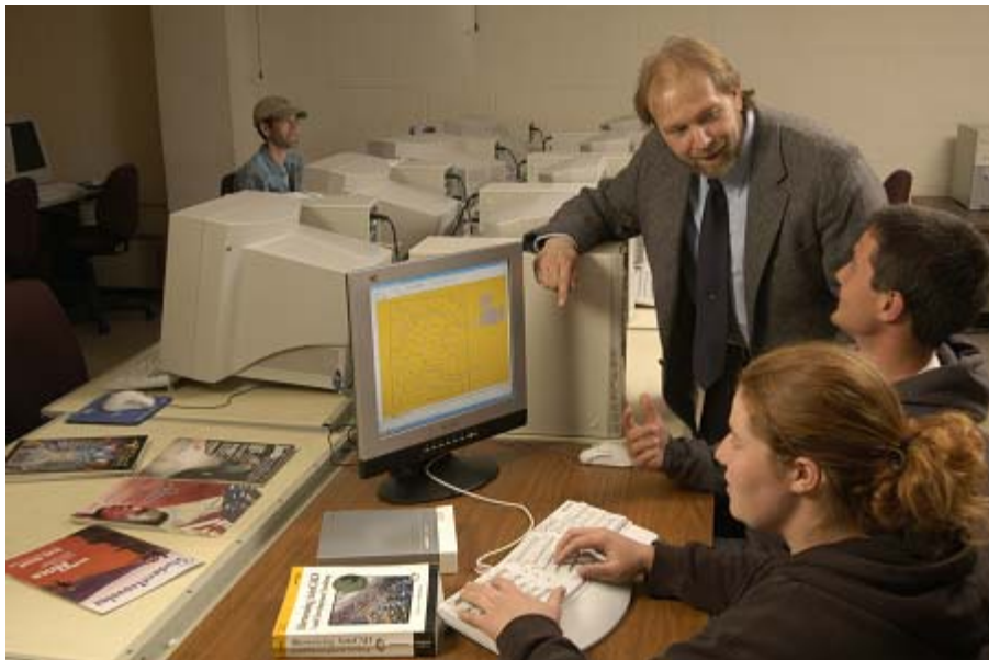
Students working with a professor in one of our many computer labs