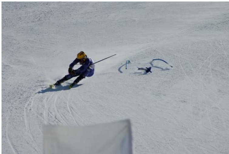
Students participate in many sports, even Alpine ski racing