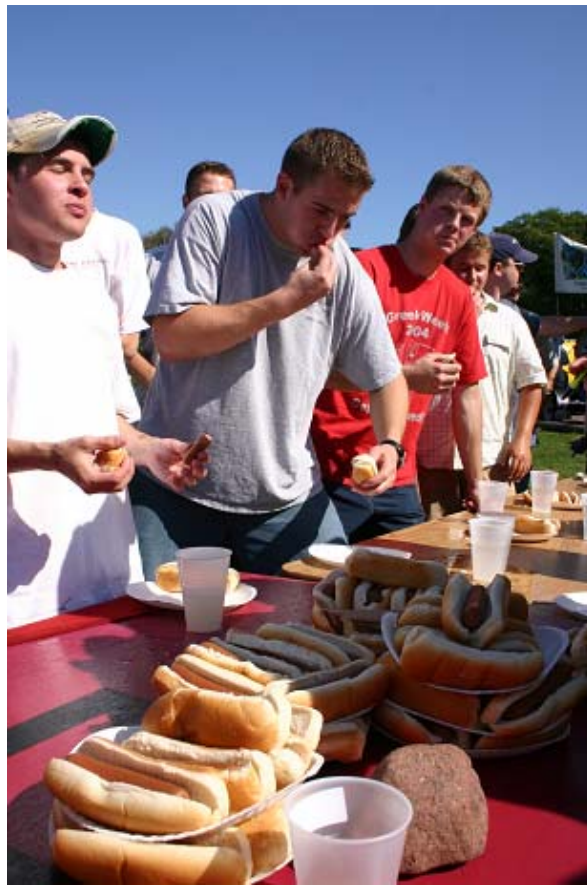
K-Day is an annual MTU Tradition