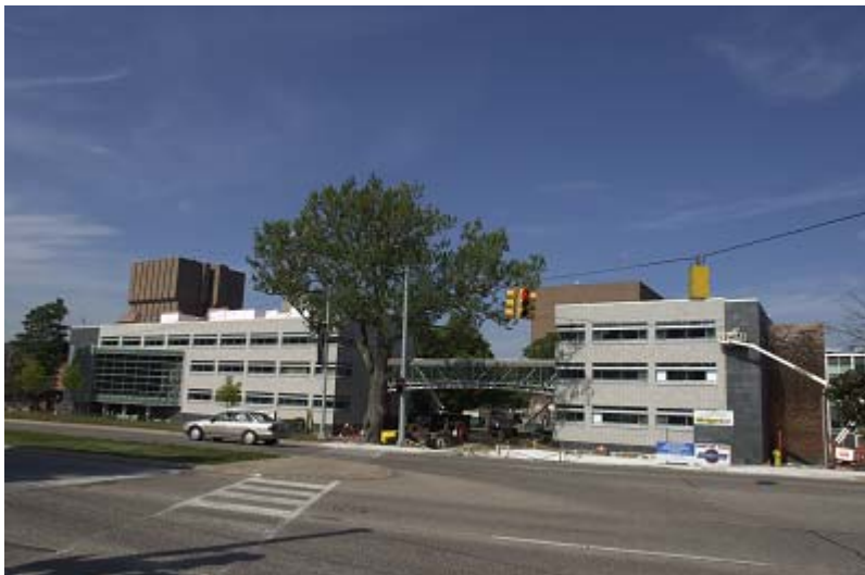
Construction of the Ann and Kanwal Rekhi Computer Science Hall and the John & Ruanne Opie Library