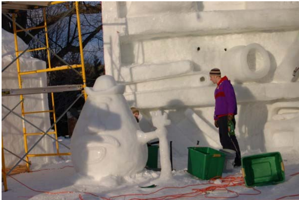
Even in winter, students keep their spirits high with Winter Carnival