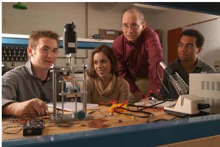
Electrical Engineering Lab