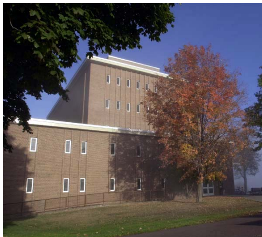
The Administration Building