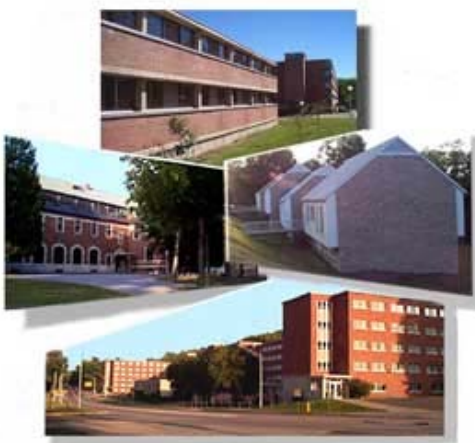
Student resident halls and apartments