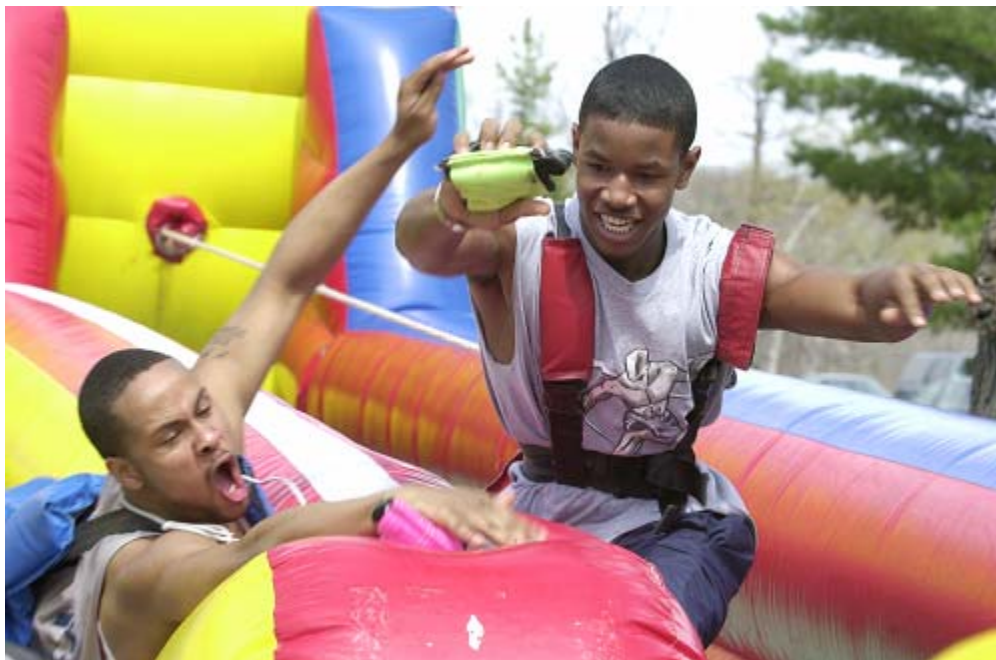
Spring Fling is a chance for the student to take advantage of the weather after the snow melts